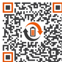
Frequently Asked Questions