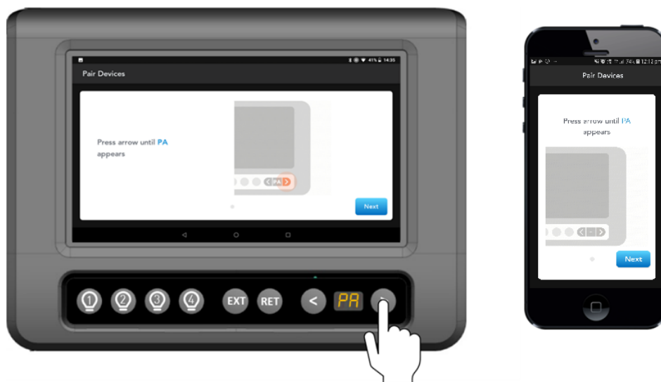
Use < or > to navigate to the 'PA' menu item