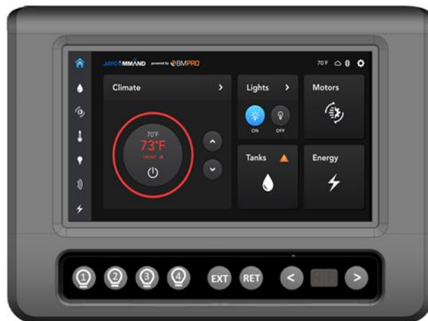
Figure 7: JAYCOMMAND CONTROLLER Home screen after pairing successful