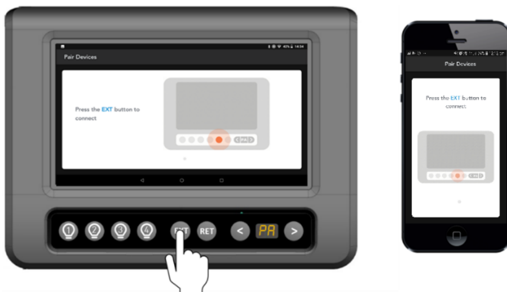
Figure 3: Press EXT once, to start the pairing process