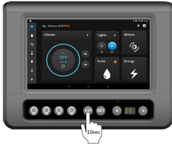
Figure 6: Go to PA, then Press and hold EXT until the number 1 scrolls across the JAYCOMMAND CONTROLLER