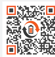
MANUALS & HELP GUIDES

We recommend plugging the RV into shore power for a few hours to allow the controller to charge. In the meantime, use the mobile app to control the RV.