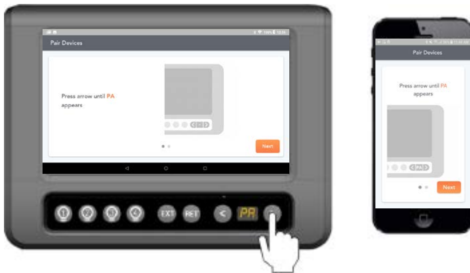
Figure 1: Use < or > to navigate to the 'PA' menu item