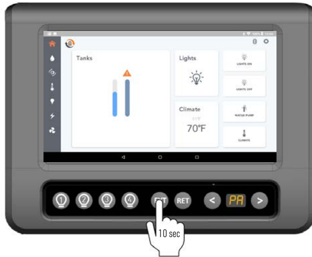
Figure 5: Go to PA, then Press and hold EXT until the number 1 scrolls across the CONTROLLER