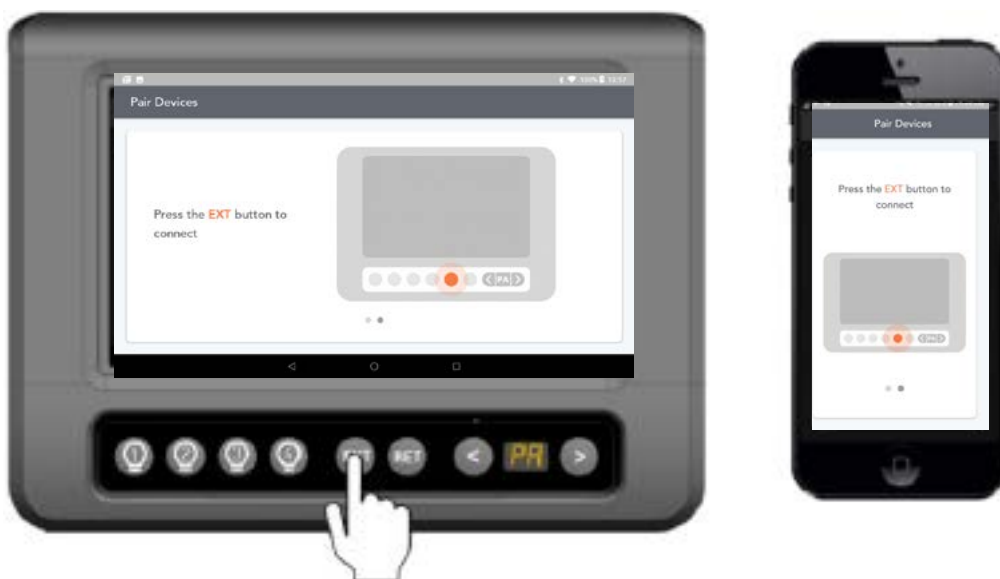
Figure 2: Press EXT once, to start the pairing process