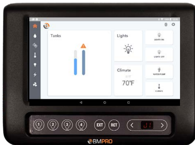
Figure 6: CONTROLLER Home screen after pairing successful