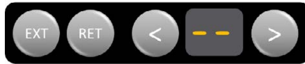
Figure 3: Failed to connect