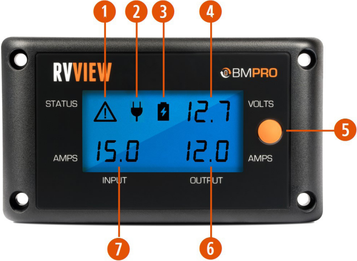
Figure 1: The RVView Monitor