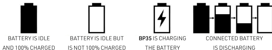
Figure3: RVView battery status indications

Displays the status of the caravan battery connected to the BatteryPlus35 .